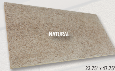
23.75" x 47.75"