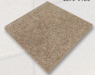
23.75" x 23.75"