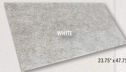
23.75" x 47.75"