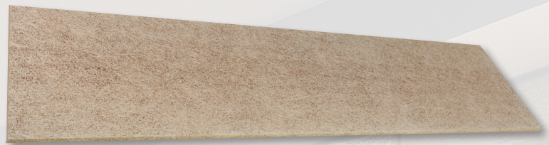
23.75" x 95.5"