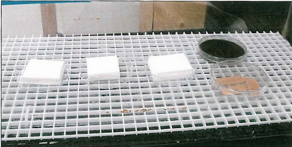
Pictured above are the three replicates tested of sample Poly Max™ 9.4 PCF ½” (100% Polyester Acoustic Panel) and the test controls in the test chamber at Day 21.