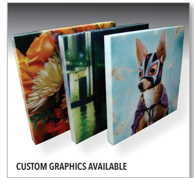
CUSTOM GRAPHICS AVAILABLE