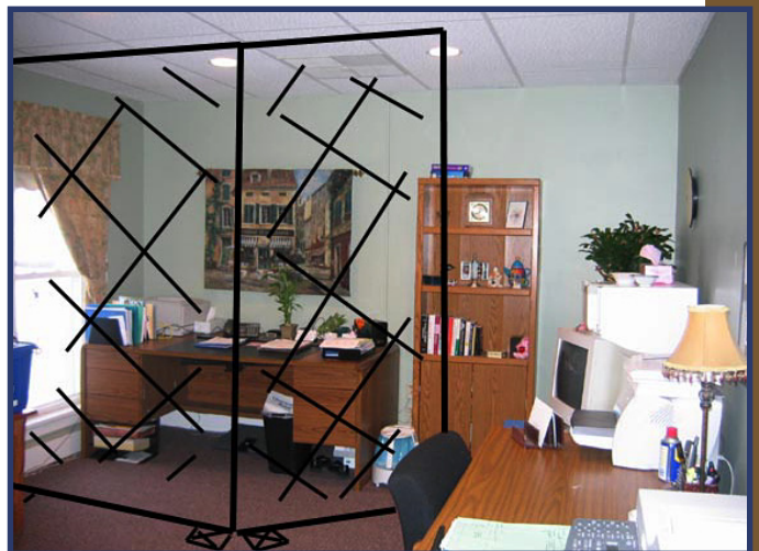
Sketch showing proposed location & scale of screen.

room. The first was that the sound barrier could not be a permanent addition to the room. Because the company was renting the space, the product that was to be installed would have to be easily removable. The second prerequisite was that it had to be aesthetically acceptable. They did not want to have an eye sore to work around all day.