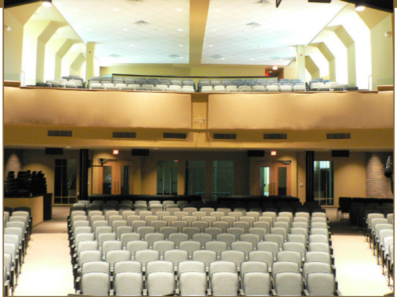
The choir and director at the new life church were getting a significant echo caused by the curved flat surface that made up the structure of the balcony. Because the building was brand new, they needed a decorative acoustical panel that would fit the curve of the large, flat reflective area.