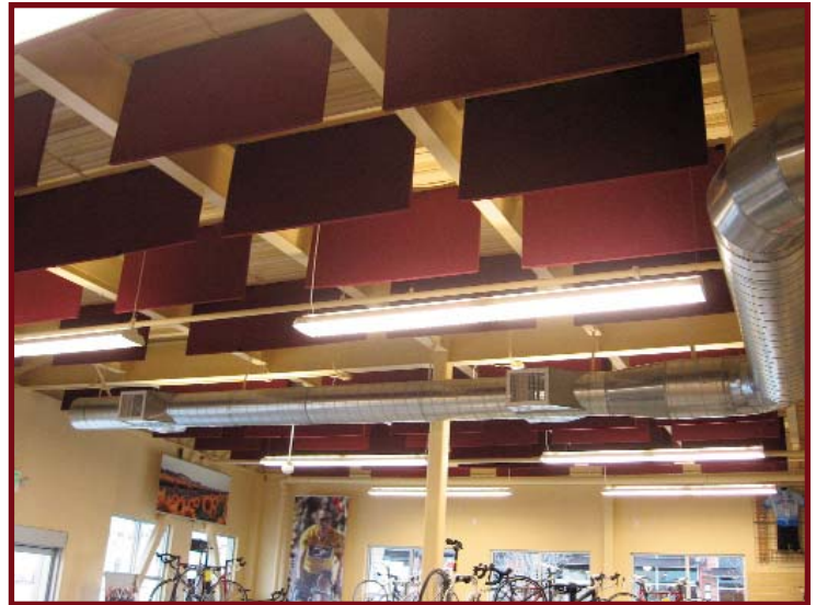
The owners and employees chose to install eighty of our 1" thick, #3 lb. density Burgundy Echo Eliminator panels as an economical yet effective and simple way to treat this space. The grommets were installed and the panels were installed by the employees. It is very important to keep the fire suppression sprinkler system in mind when considering hanging baffles.