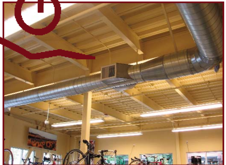
Exposed metal roof decks have replaced standard drop ceilings, which would potentially help in reducing the echo in the space.