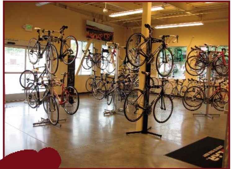
Retail orientated but industrial looking spaces like this are very popular, simple and serve a useful purpose but because of all of the hard surfaces, noise problems are quite common.