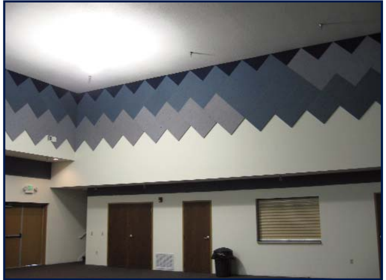
This room measured roughly 55' x 65' x 20' ceilings. The church decided to install 1,552 square feet of acoustical paneling into the space which is just over 2% of the cubic volume of the room (71,500 cubic feet) and was very successful in significantly reducing the echo within the room.

"Where should I put these panels?" My answer to this question almost always surprises people. For all practical purposes, to take the edge off of a room, the exact location of the acoustical wall panels or ceiling panels does not matter nearly as much as the square footage of panels introduced into the