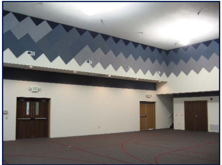
This quilt-like zigzag pattern was the design of the church members. They used the light gray, medium blue and pure blue 2'x4' panels to create the pattern. The installers used our ASI Knife blade in a table saw to cut the panels as needed.

“How many panels do I need?” As far as echo and reverberation are concerned, the larger the room, the more square footage of acoustical treatment is needed to get the proper level noise control. Over the last few years, I have talked to thousands of people and a series of the same questions continues to be asked. “How many panels do I need?” This is a simple question that needs to be asked. The answer, however, is not as simple because rooms and the needs of the rooms are always different. For simplicity’s sake, I know that rooms like this don’t need “recording studio” sound quality. They do need a noise control solution that takes the edge off so that when the room is filled with people the noise level is not ear splitting.