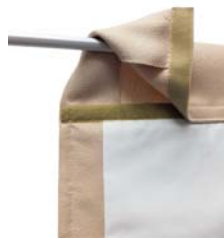
Back of Rod Pocket with Hook & Loop