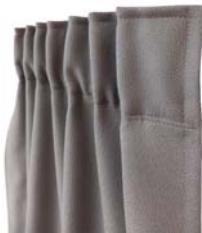
Pleated with Hooks