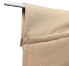
Rod Pocket with Hook & Loop