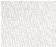
RB Cloth White