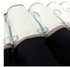
Back of Pleated with Hooks